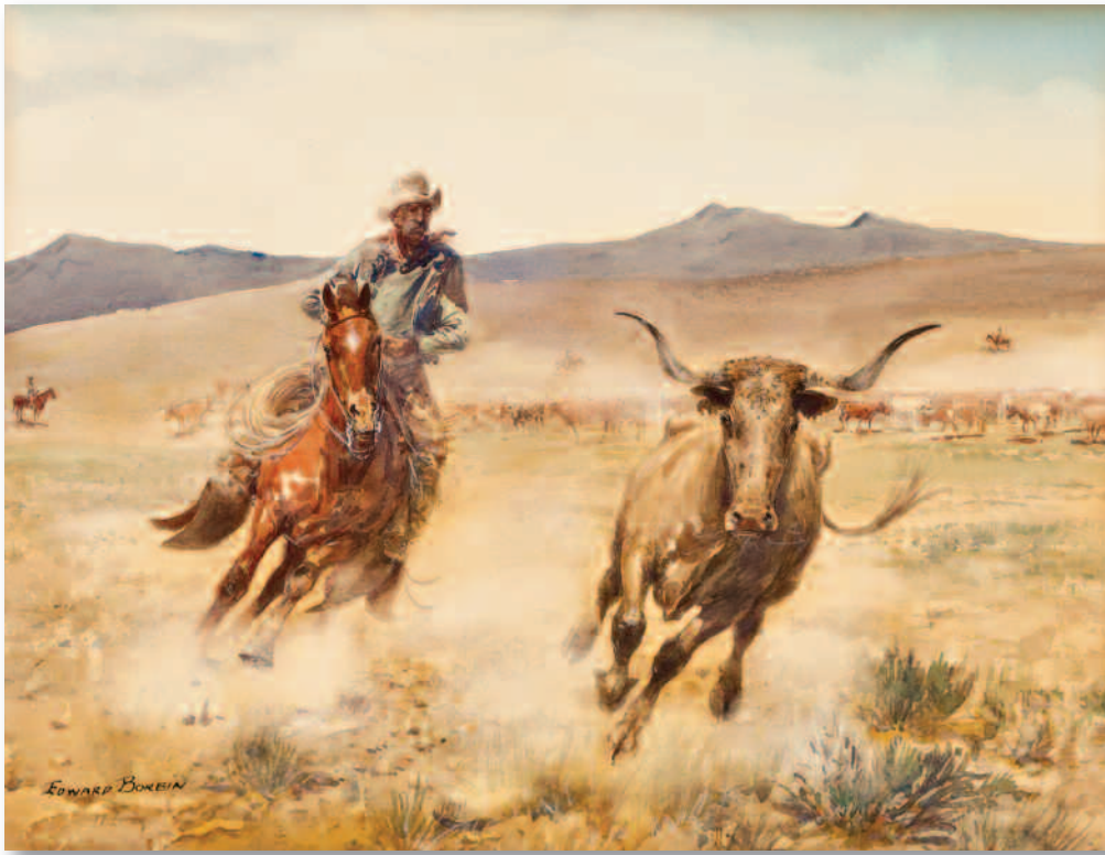
This is probably one of the finest watercolors ever painted by Borein because of the quality of the draftsmanship plus the beautiful action of the principal figures. It is my favorite.