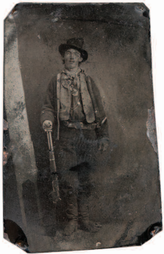
The Upham tintype or ferrotype, 3" x 2", photographer unknown, c. late 1879 or early 1880. It is the only authenticated photo of Billy the Kid, most likely taken by a traveling photographer in Fort Sumner New Mexico